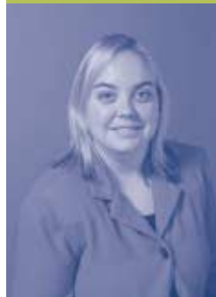
Jodi Hart Tax & Accounting

"The good news is your books were out of balance by 57 cents, but 6 of my best CPAs tracked down the mistake!"